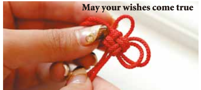
May your wishes come true