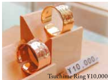
Tsuchime Ring ¥10,000