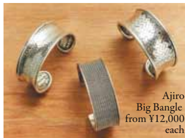
Ajiro Big Bangle from ¥12,000 each