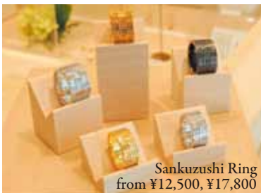
Sankuzushi Ring from ¥12,500, ¥17,800