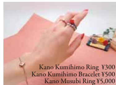
Kano Kumihimo Ring ¥300 Kano Kumihimo Bracelet ¥500 Kano Musubi Ring ¥5,000