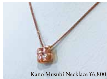
Kano Musubi Necklace ¥6,800