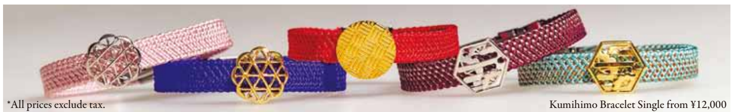
*All prices exclude tax.