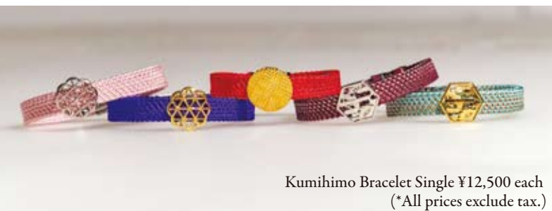
Kumihimo Bracelet Single ¥12,500 each (*All prices exclude tax.)

mizu+abura's original Kumihimo braid and silver accessories are also available for sale. Please come and visit.