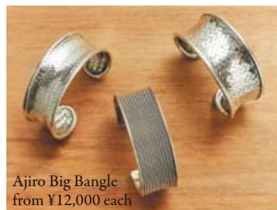
Ajiro Big Bangle from ¥12,000 each