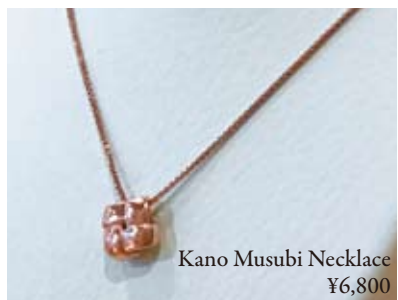
Kano Musubi Necklace ¥6,800